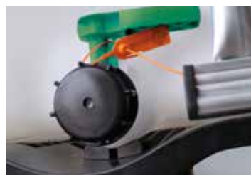
Valve, sealed The seal can be removed without using tools