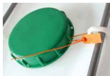
Lid sealed The seal can be removed without using tools