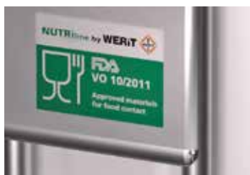
Marking FDA, VO 10/2011